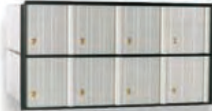
8 Doors 51/2"W x 51/2"H