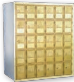
2030 30 Boxes 3 1/2"W x 5"H