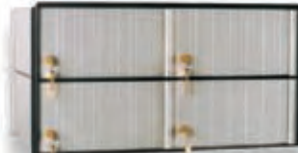
4 Doors 103/4"W x 51/2"H