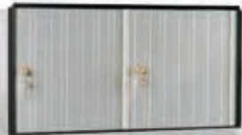
2 Doors 103/4"W x 11 1/2"H