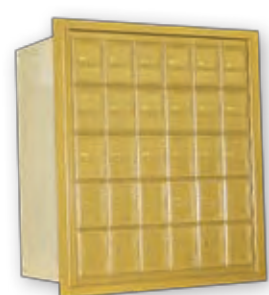
3030 30 Boxes, 3 1/2"W x 5"H