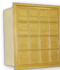
3016 16 Boxes, 5 1/2"W x 6"H