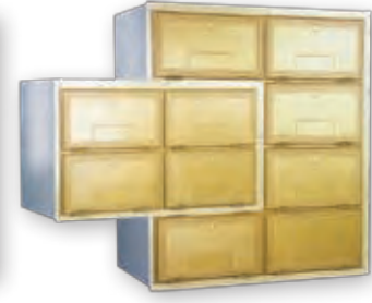
2008-1/2 2008 1/2 Module 4 boxes 8 Boxes 11" wide x 6"high 11"W x 6"H

Over all, 25 3/4"W x 28 3/4"H x 15"D, rough opening 24 3/8"W x 27 5/16"H x 15"D.