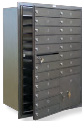
PICTURED HERE Double-Wide Doors For Flat Mail Delivery