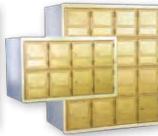
2016-1/2 2016 1/2 Module 8 boxes 16 Boxes 5 1/2" wide x 6"high 5 1/2"W x 6"H