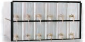
12 Doors 31/2"W x 51/2"H