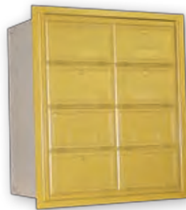
3008 8 Boxes, 11"W x 6"H