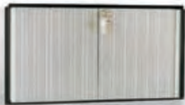
1 Door 22"W x 11 1/2"H