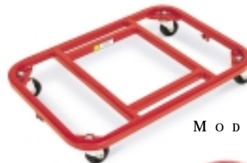
MODEL 1420 / 1430