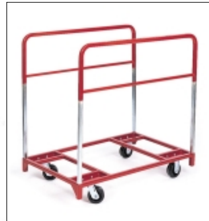
Can also be used for 30" wide tables as shown.