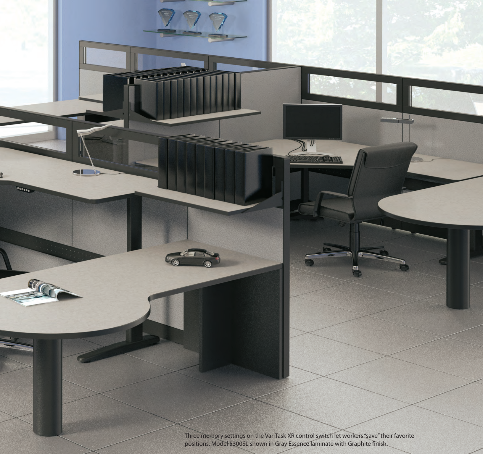
Three memory settings on the VariTask XR control switch let workers "save" their favorite positions. Model 5300SL shown in Gray Essence laminate with Graphite finish.