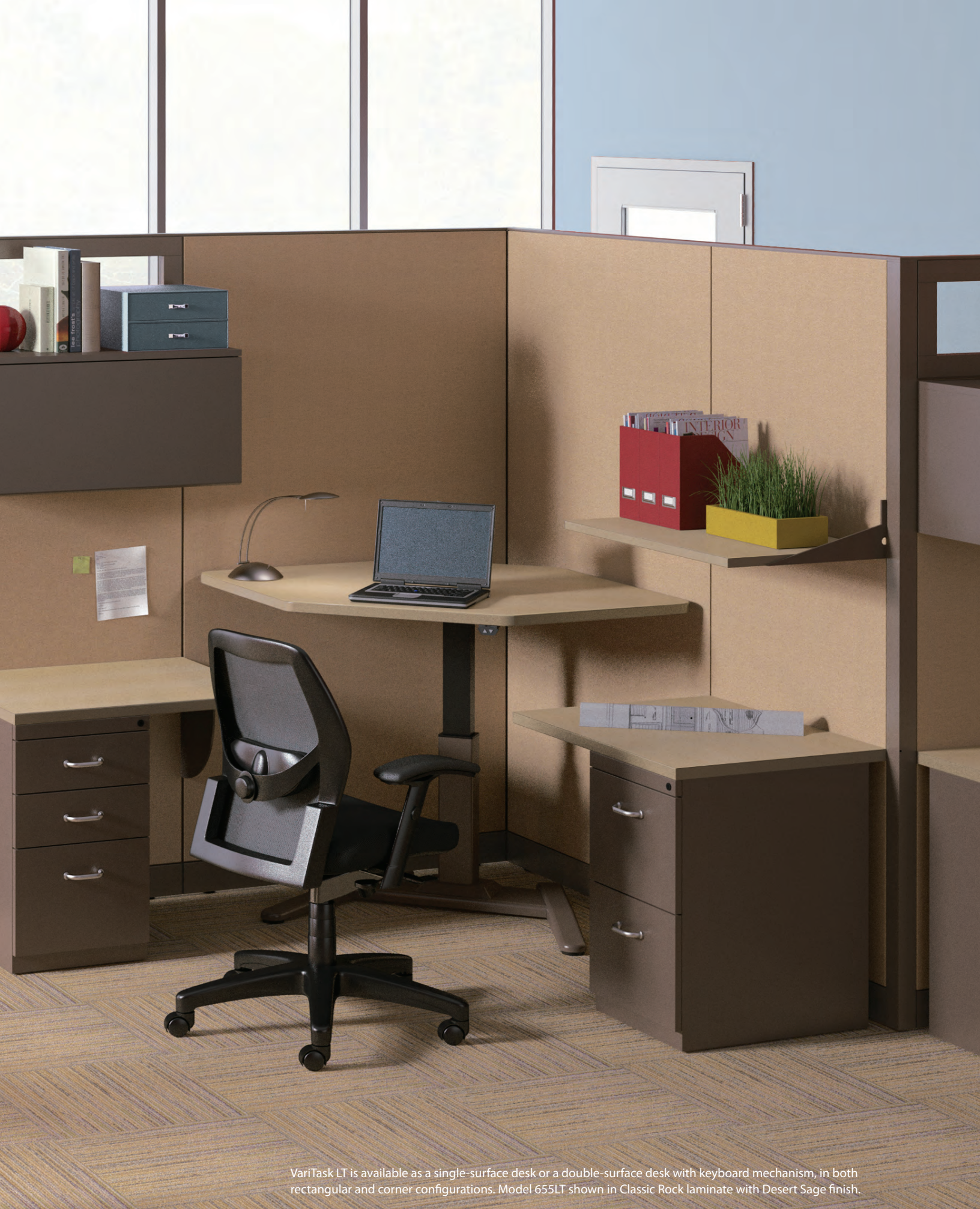
VariTask LT is available as a single-surface desk or a double-surface desk with keyboard mechanism, in both rectangular and corner configurations. Model 655LT shown in Classic Rock laminate with Desert Sage finish.