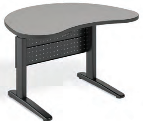
Model 530L with optional modesty panel.