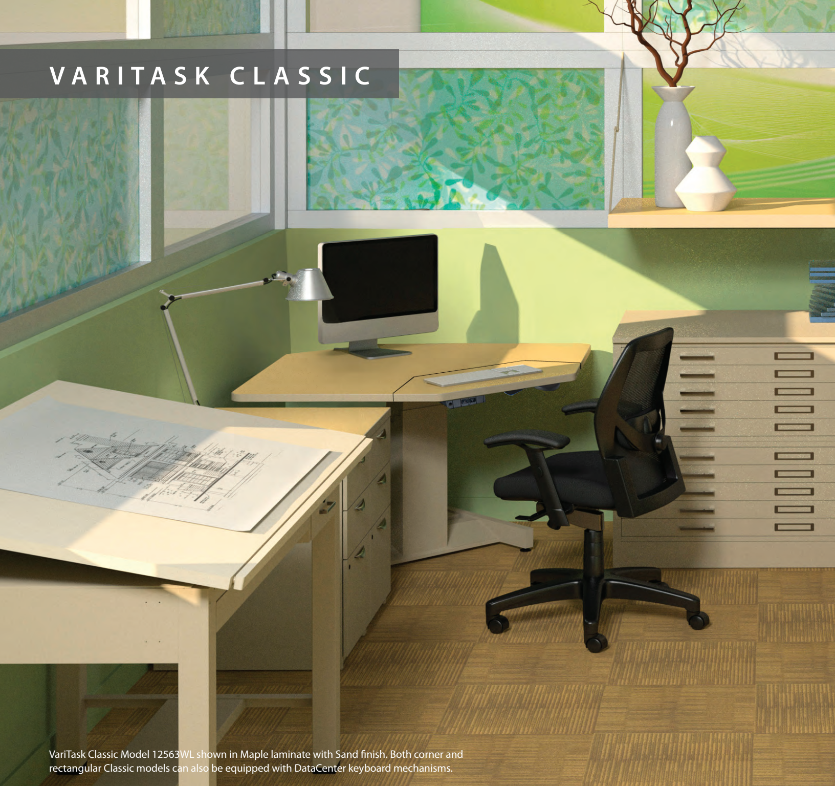
VariTask Classic Model 12563WL shown in Maple laminate with Sand finish. Both corner and rectangular Classic models can also be equipped with DataCenter keyboard mechanisms.