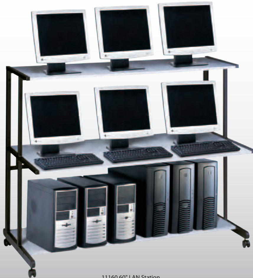
11160 60" LAN Station