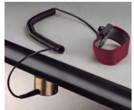
ESD accessories like wrist straps and grounding bars help protect equipment.