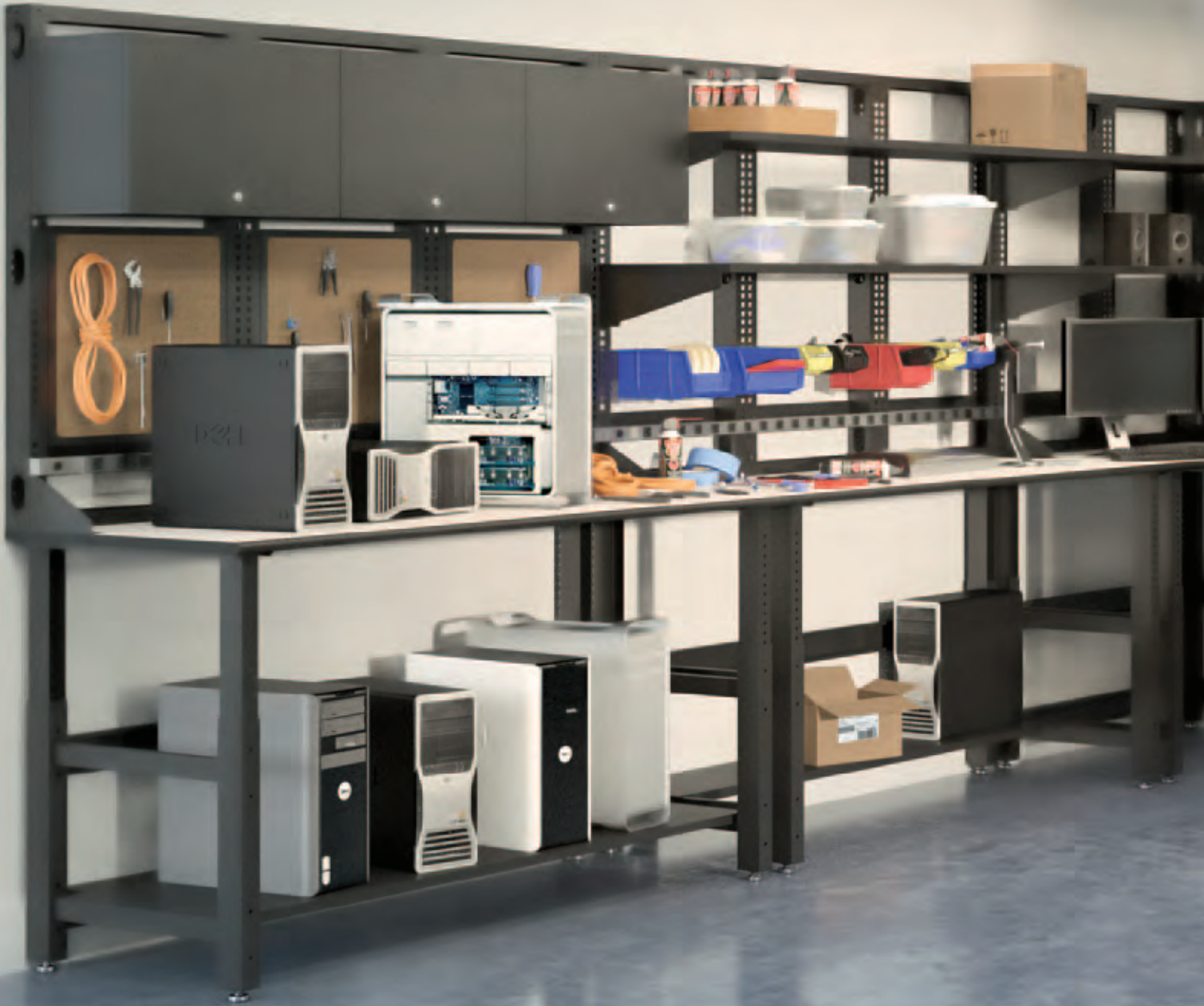
TechWorks system with Nebula Gray HPL laminate and Textured Graphite paint.