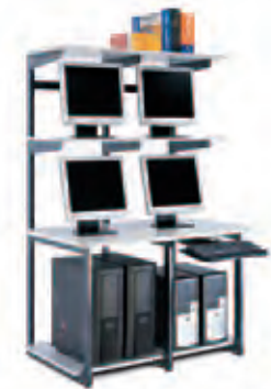
21148 48" LAN Station with optional keyboard support