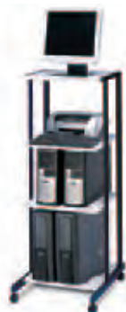
11145 24" Server Station