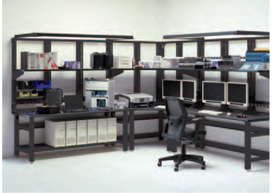
No Buckling Under. Up to 800 lbs. can be stored on shelves below worksurfaces – ideal for server storage. Shown with Nebula Graphite HPL laminate and Textured Black paint.