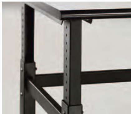
Benches can be installed at sitting or standing heights, from 26"-38" high.