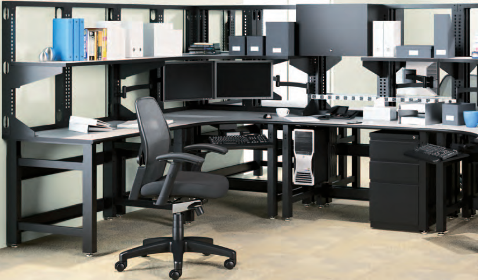
TechWorks system with Nebula Gray HPL laminate and Textured Black paint.