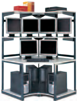
211CNR Corner Unit