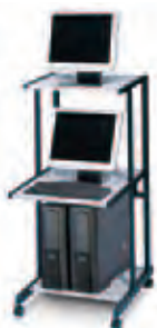
11124 24" LAN Station