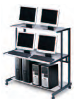
11148 48" LAN Station