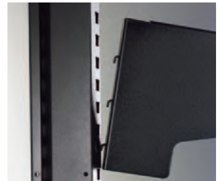
Storage options install and reconfigure above worksurfaces in 1" increments.