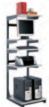
21145 24" Server Station