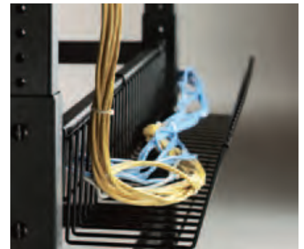
Optional baskets keep cables off the floor to maximize safety.