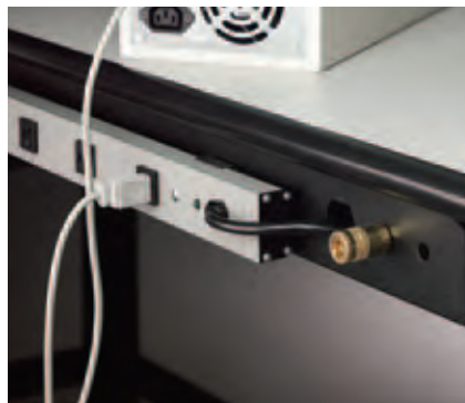
Air, gas and vacuum disconnect fixtures can be positioned on service bars.