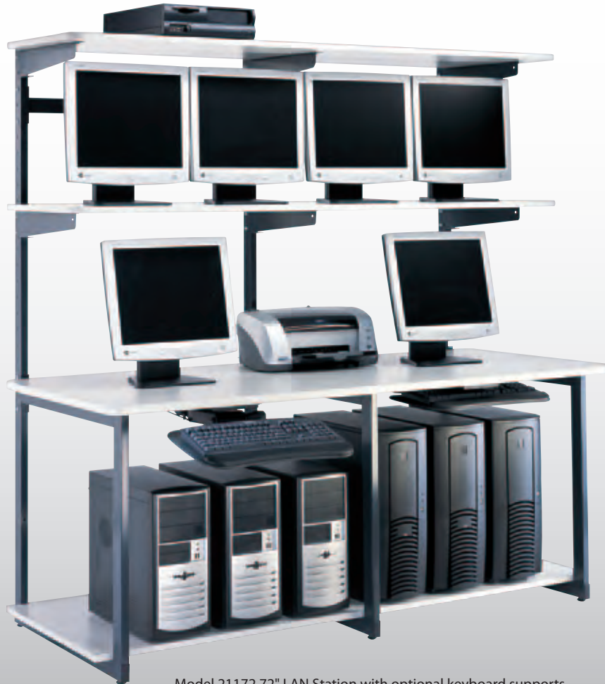
Model 21172 72" LAN Station with optional keyboard supports