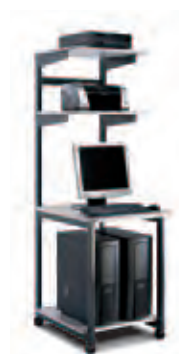
21124 24" LAN Station with optional casters