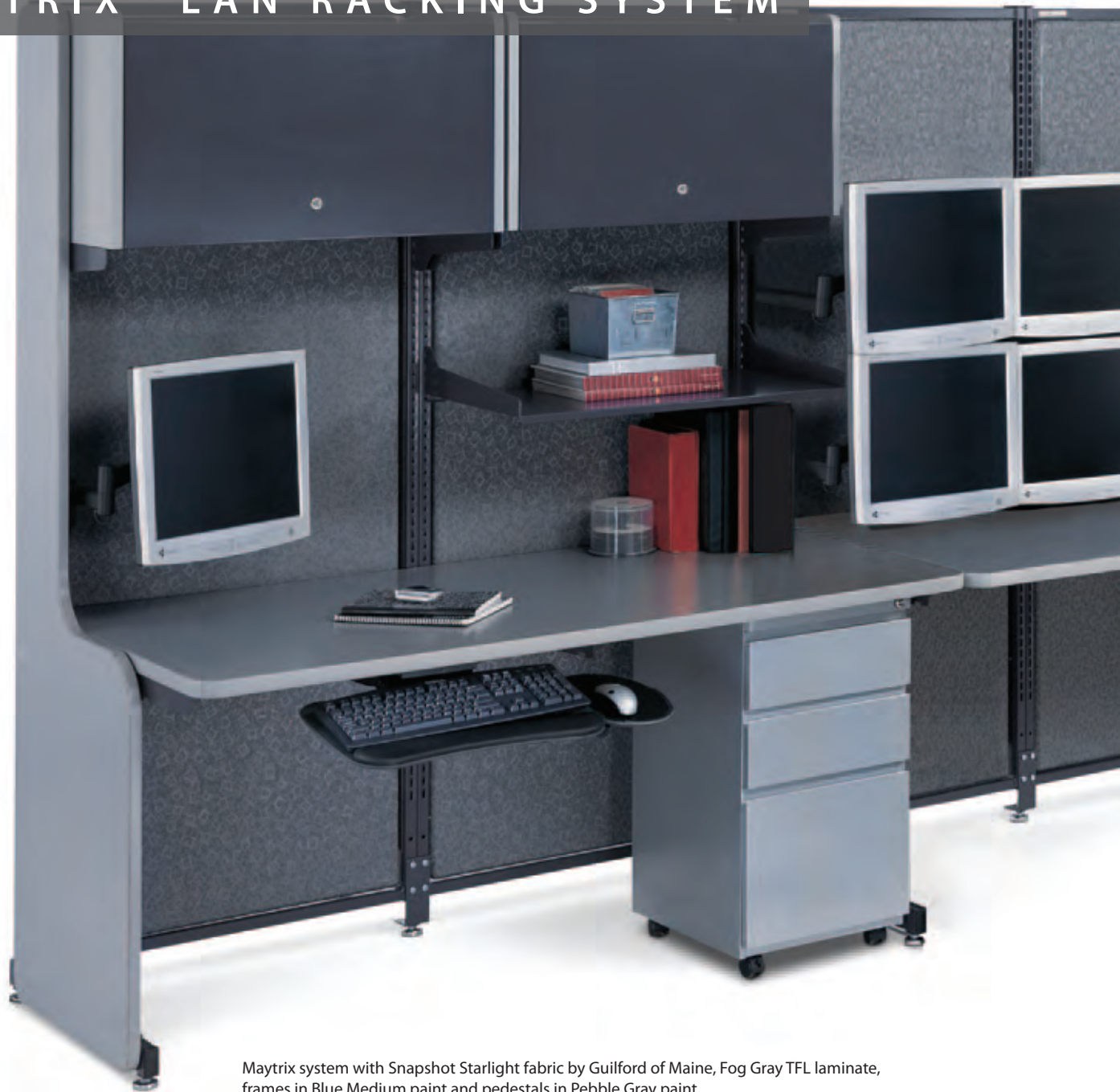
Maytrix system with Snapshot Starlight fabric by Guilford of Maine, Fog Gray TFL laminate, frames in Blue Medium paint and pedestals in Pebble Gray paint.