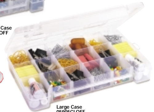
Large Case 05905CLOFF