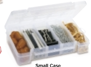
Small Case 05709CLOFF