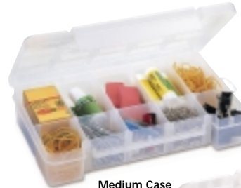
Medium Case 05807CLOFF