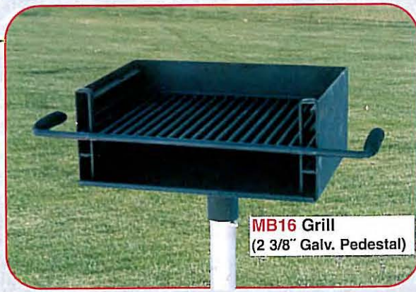
MB16 Grill (2 3/8" Galv. Pedestal)

Utility Shelf - 8" x 20" x 3/16" (painted black) bolts onto rear. Available for any grills on this page. Model# "UT" is painted black. Model# "UTG" is galvanized.