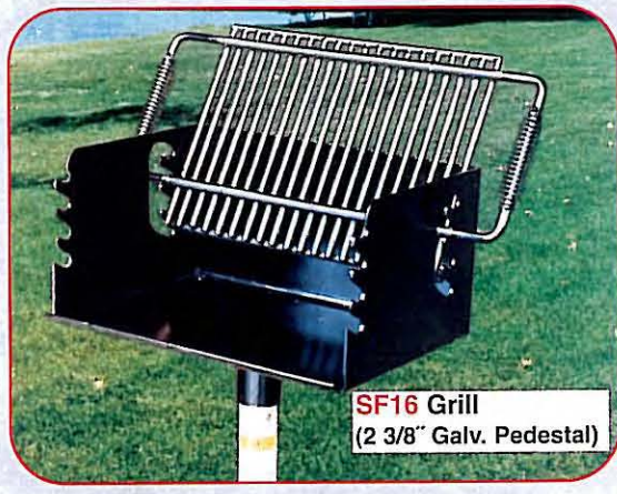
SF16 Grill (2 3/8" Galv. Pedestal)