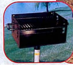
SB16 Grill (2 3/8" Galv. Pedestal)