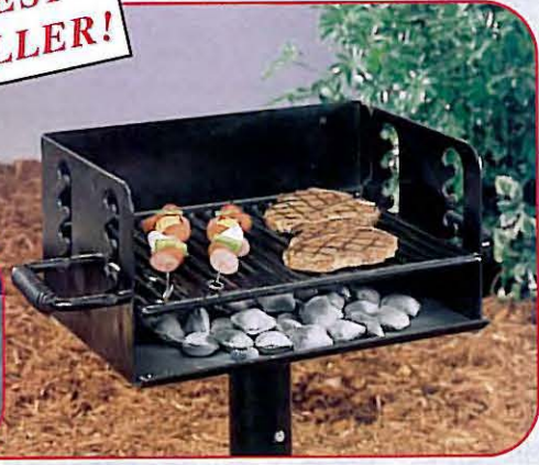
SB1635 Grill (3 1/2" O.D. Galv. Pedestal)