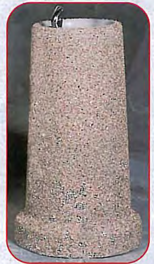
MODEL CDFPBC SHOWN IN PERMASTONE DOVE GRAY

is worry-free near outdoor sports fields, hiking trails, etc. Choose concrete color and texture you prefer. Comes in various model features. Optional concrete child step can be purchased so youngsters can get up to drink from bubbler. Model shown is #CDFPBC with a PermaStone aggregate finish, dove gray color, concrete bowl and push button on the bubbler.