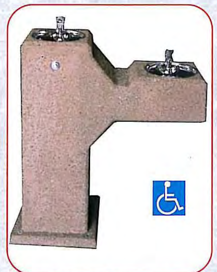
SHOWN IN LT. BROWN, LT. SANDBLAST