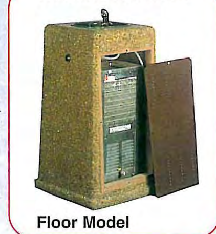
CONCRETE ELECTRIC COOLER