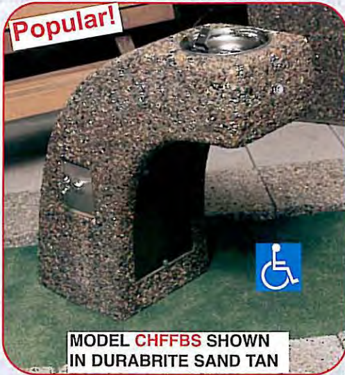
MODEL CHFFBS SHOWN IN DURABRITE SAND TAN