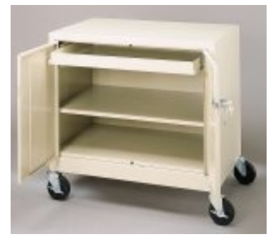
One Adjustable Shelf Two Shelf Spaces One Roll-out Drawer. Inside dimensions 301/4"W x 22 7/16" D x 21/2 H

Outside dimensions including casters: 37¼" W x 25¼" D x 35"H