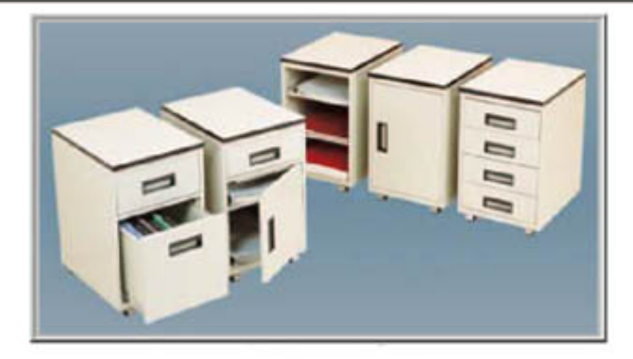
4505 | 4503 | 4506

All Cabinets: 15" wide, 20" deep, 24 1/2" high