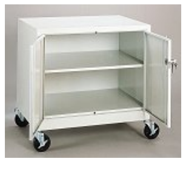
One Adjustable Shelf Two Shelf Spaces