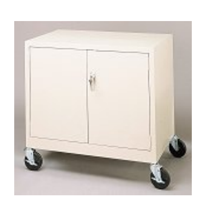
Two choices of 35" high Mobile Storage Units