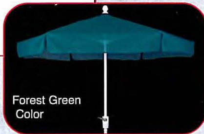
Forest Green Color