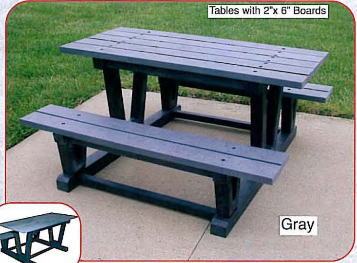
Tables with 2"x 6" Boards