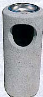
CSTR-1332 13"dia x 32"h 200 lbs. $379.00