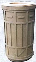
CSK-1524 15"dia x 24"h 180 lbs. $217.00