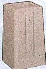
CSS-1424 14"sq x 24"h 145 lbs. $120.00