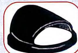
PLH3255 - Plastic Hood. $189.00 (Fits 32 gal. VP receptacles and 55 gal. drums.) 11 lbs. Black. 24 1/2" I.D.

(Fits CG20, CP20 cans) 8 lbs. 20 1/8" I.D.