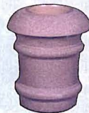
CSA-2319 19"dia x 23"h 225 lbs. $218.00