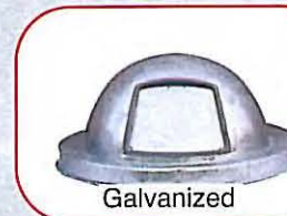
DLG30 Galv. Dome Lid $86.00