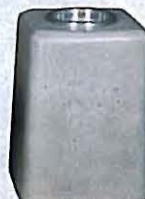
CSS-1521 15"sq x 21"h 175 lbs. $186.00