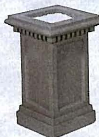
CSV-1524 15"sq x 24"h 130 lbs. $217.00