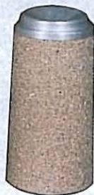
CSR-1224 12"dia x 24"h 130 lbs. $207.00