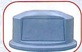
DLTH32 - Plastic "Top Hat" $85.00 (Fits 32 gal. VP receptacles and 55 gal. drums.) 13 lbs. Gray. 24 1/4" I.D.

(Fits 55 Gal. Drum) 12 lbs. 23 3/4" I.D.