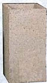
CSS-1632 16"sq x 32"h 357 lbs. $233.00