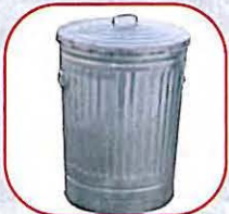
CG32-32Gal. Galv.Can $82.00 (Fits all 132LR&Canposts) 17 lbs.