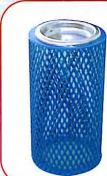
SVP1224 12"x24"Snuffer 35 lbs. $110.00