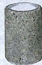
CSR-1117 11"dia x 17"h 77 lbs. $151.00