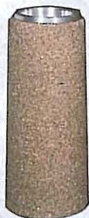
CSR-1130 11"dia x 30"h 185 lbs. $188.00