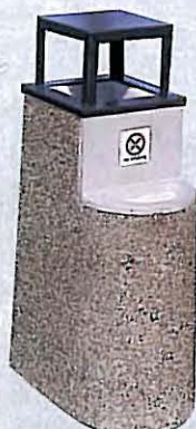
CSTD-1440 14" x 21" X 40" 335 lbs. $297.00