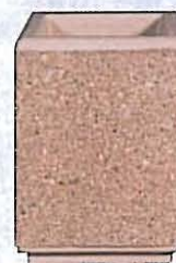
CSS-1824 18"sq x 24"h 300 lbs. $218.00