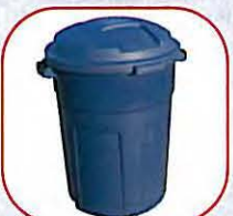
CP32-Plastic Can $24.00