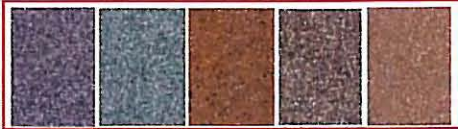
Charcoal Granite Verdi Granite Brazilian Granite Monument Granite Indian Granite