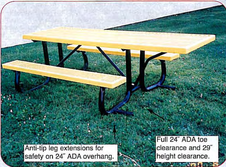
Anti-tip leg extensions for safety on 24" ADA overhang.