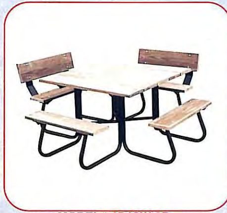
MODEL# 4SJCW-2B (Shown w/2 backrests)