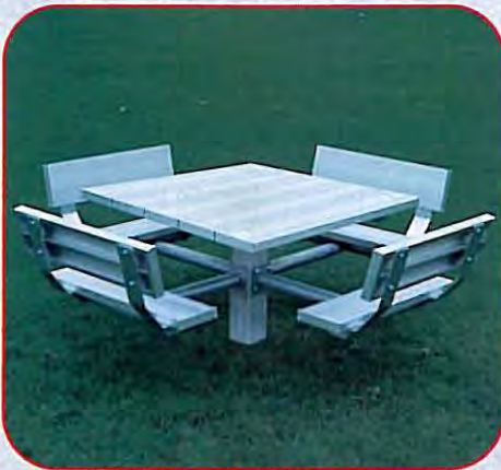
MODEL# 4SPTGA-4B (Shown w/4 backrests)