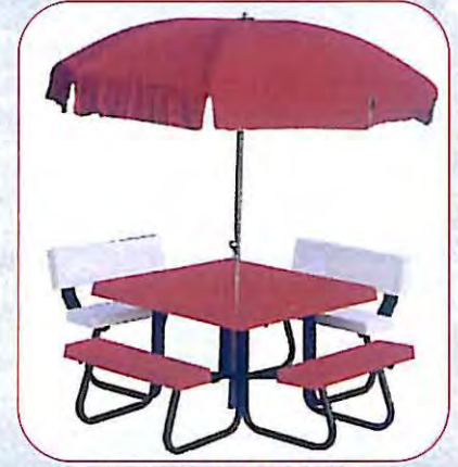
Model# 4SJCF-2B-UV (Shown w/2 backrests & vinyl umbrella)