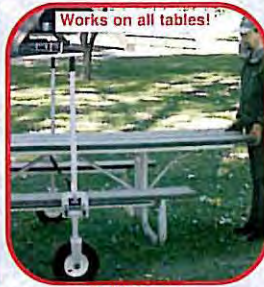
Tableporter 33 lbs. $258.00