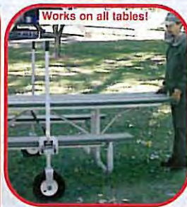
Works on all tables!

6BGW 6FT SYP Wood 173 lbs. $232.00 8BGW 8FT SYP Wood 212 lbs. $263.00