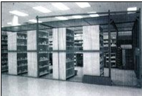
DEA approved storage area with clear spanned ceiling.

Most enclosures can be built from standard modular parts. However, we are glad to accommodate custom applications and can handle any special requirements your installation may need.