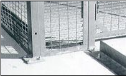
Panels mount flush to floor.

Class III, IV, and V controlled substance storage areas require a high level of security to pass D.E.A. inspections. Such an installation-as pictured above left-has many notable features.