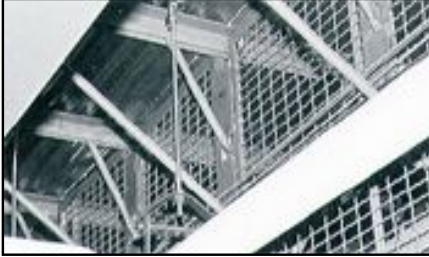
Factory made cutouts fit around building structure.

Mounting hardware permanently fixed. Although our standard 3/8" mounting hardware is the heaviest in the industry, and inaccessible from outside the enclosure, the D.E.A. requires that all mounting hardware be brazed, pinned, or tack welded in place. Style 840 eases this job by allowing the installer clear access to the hardware from inside of the cage.