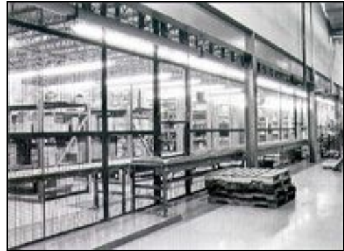
Floor to ceiling secured area.

Compliance with Drug Enforcement Agency regulations for in-plant security of controlled substances presents recurring problems for drug manufacturers, distributors, and wholesalers. Wire Crafters Style 840 Partitions can help solve this problem. When properly installed, Style 840 Partitions meet the D.E.A. requirements for physical security of Class III, IV, and V controlled substances as outlined in Section 1301:72 of the Code.